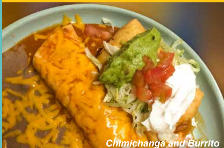
Chimichanga and Burrito