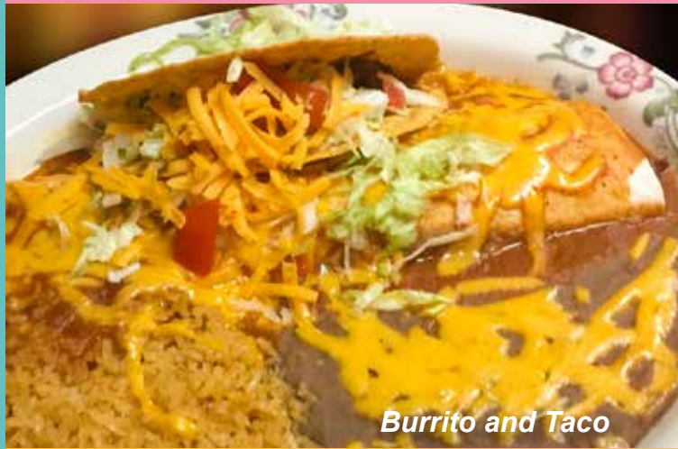
Burrito and Taco