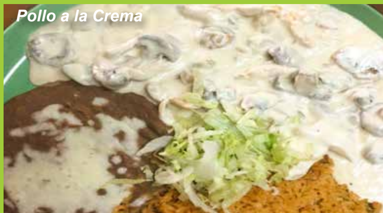
Pollo a la Crema

Boneless chicken breast sautéed in a special red sauce with mushrooms and green onions. Served over a bed of rice and melted jack cheese 14.29 (No beans)